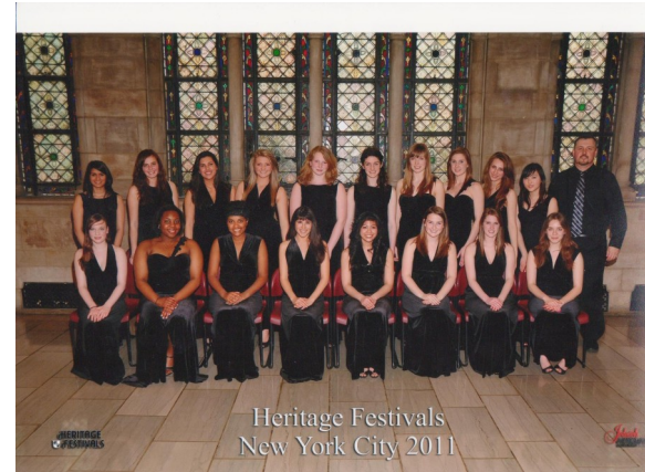
C Flats Jazz Ensemble